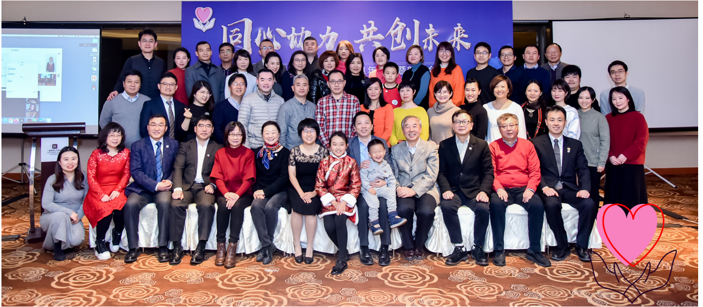
Yoneyama China Alumni Association held annual party at Jing'An Kuntun on January 16, 2021, attended by 56 members, family and guests offline and around 20 members online.